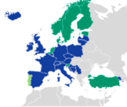
Map 5. Audio subtitling provided (2019)