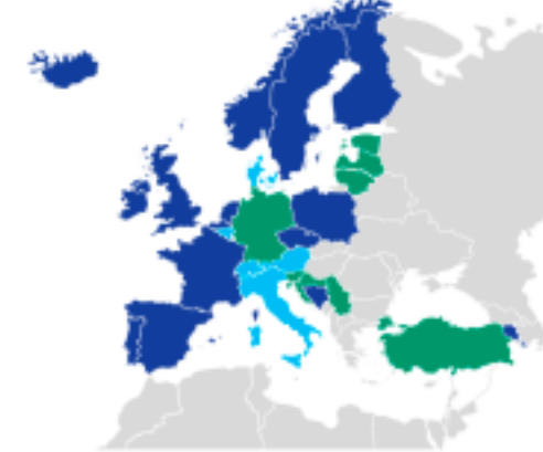
Map 1. National and regional regulations on subtitling (2019)